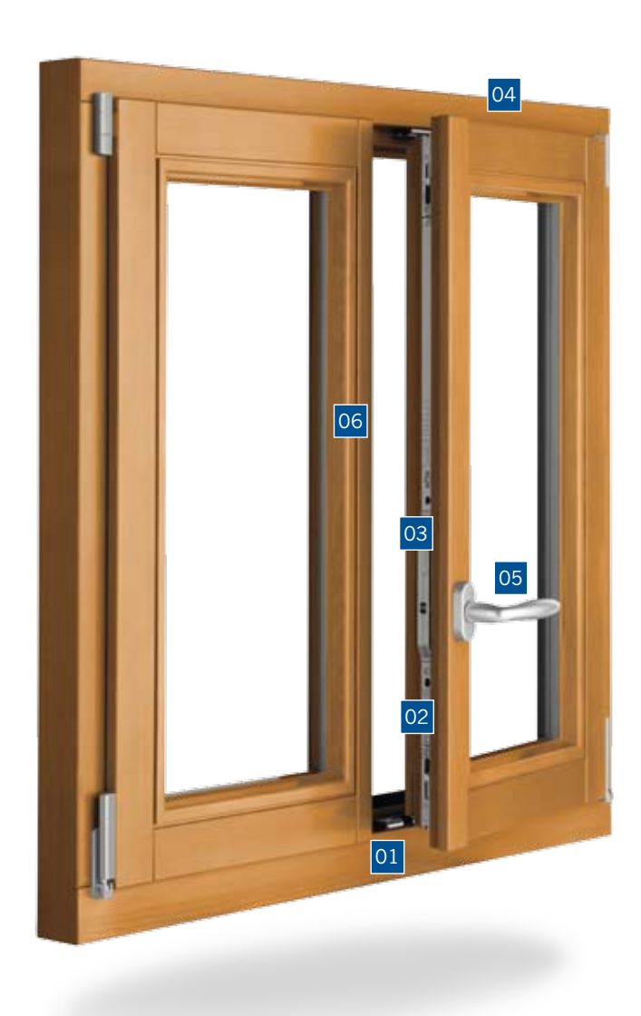
The new assortment for long-life wooden windows.